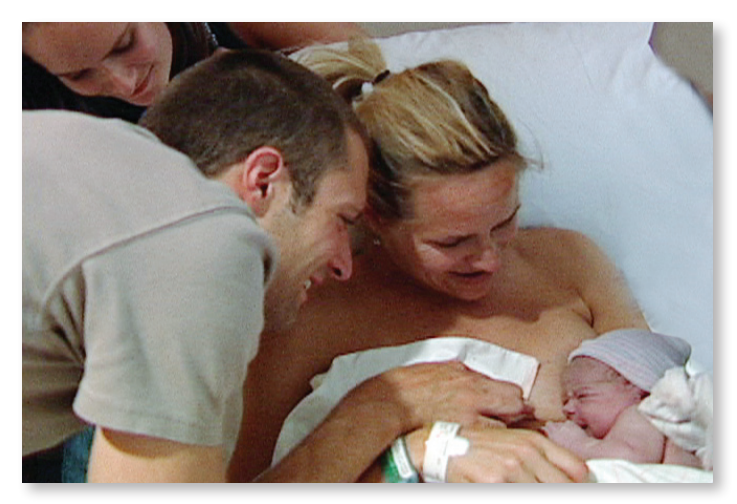
The Six Lamaze Healthy Birth Practices can help you have a safer and healthier birth.

et's face it—birth isn't easy. Many mothers proudly claim it is the most challenging work they have ever accomplished. But the truth is you have everything you need to accomplish this everyday miracle.