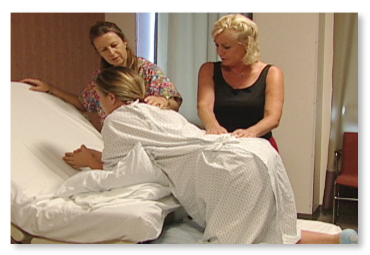
Hospital beds can be adjusted to support a variety of pushing positions.