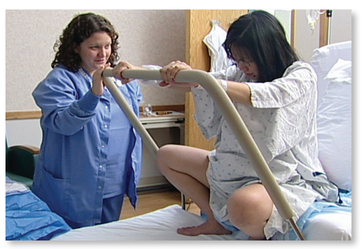
Upright pushing positions use gravity to your advantage.

Tatching women give birth on TV and in the movies, it is easy to think that there is only one way to push during birth—with the woman on her back with her legs propped up, holding her breath and pushing while others count to 10 and coach her to push harder. In fact, this is how most women in the United States push. But research tells us that this type of pushing is harder on mothers and babies than a more supportive approach.