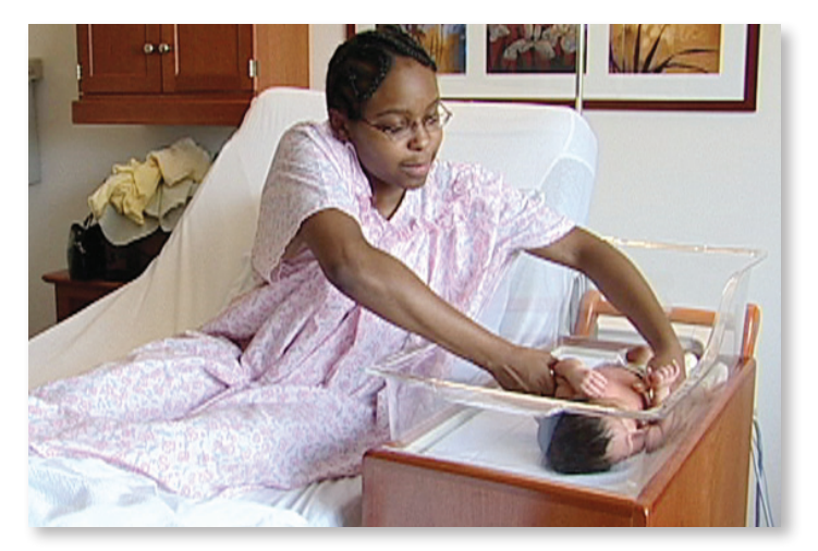
Rooming-in with your baby makes it easier for you to respond to her needs.

But research shows that you are likely to get just as much sleep with your baby in your room as you would if your baby were in the nursery. Research also tells us that babies who go to the hospital nursery at night cry more and are more likely to have trouble breastfeeding than babies who room-in with their mothers.