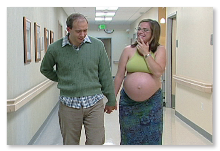
Walking during early labor helps keep labor moving.

One position that is rarely comfortable and may be unsafe for your baby is lying flat on your back. In this position, the blood vessels that bring oxygen to your baby can be compressed, and your baby may show signs of distress.