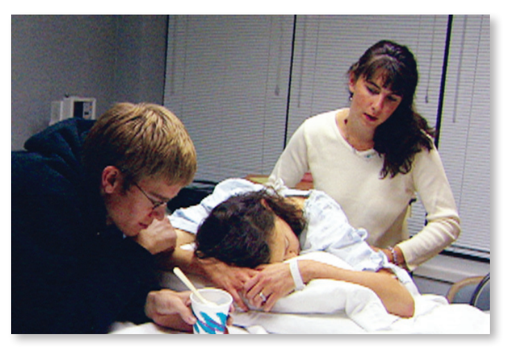
Doulas work in cooperation with other support people to provide continuous hands-on support.

Because the birth environment can play such a critical role in your comfort level and the progress of your labor, consider having only a few key skilled support people with you during labor, and wait to invite others in until after the birth of your child. Keeping your room quiet, calm, and private will help you stay focused and comfortable enough to follow your body's natural instincts.