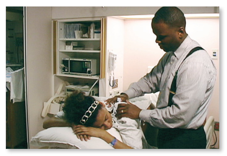
Partners who learn about labor support techniques are particularly helpful to laboring women.