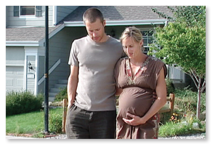
Letting labor progress at its own pace makes natural methods more effective.

In most cases, listening to the baby's heartbeat periodically during labor (called "intermittent monitoring") is just as safe for babies and safer for mothers. And it does not interfere with a woman's ability to move around in labor.