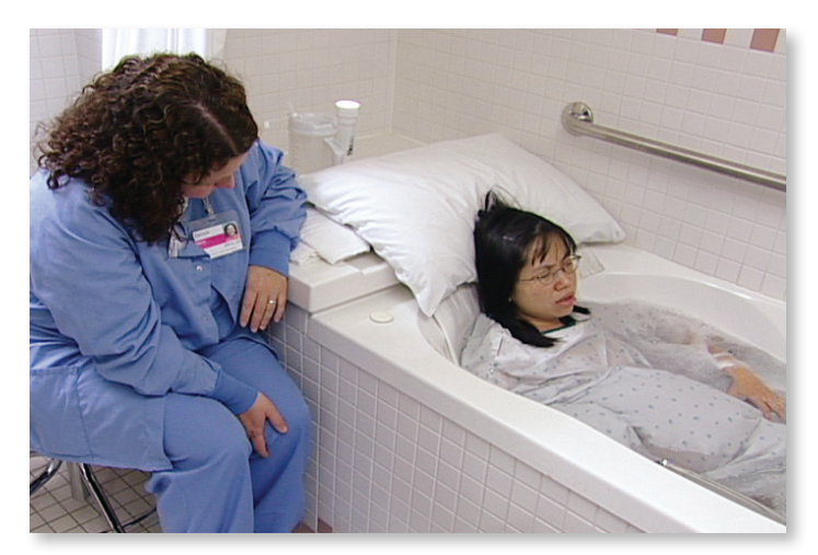
Soaking in a tub can be very soothing when labor gets hard.