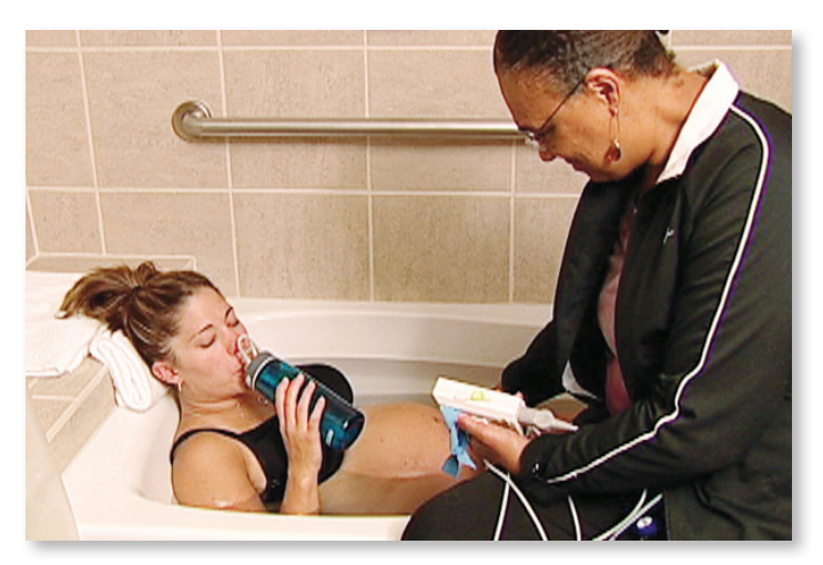
Using comfort measures, drinking water and having intermittent monitoring can help you avoid unnecessary interventions.

For women with particularly long or difficult labors, easing the pain of labor can help ensure a healthy vaginal birth. But there are many non-drug pain-relief methods that are very effective and can make birth easier rather than more difficult. These include movement, position changes, a hot shower, soaking in a tub, massage and other "hands-on" techniques, and breathing and relaxation exercises.