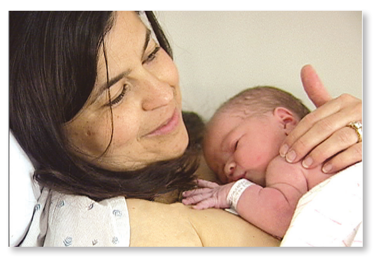
In most cases, your baby gets everything she needs when you hold her skin to skin.

baby's nose and mouth, giving routine medications, or taking the baby to the warmer for observation can be delayed, performed while baby is skin to skin, or avoided altogether.