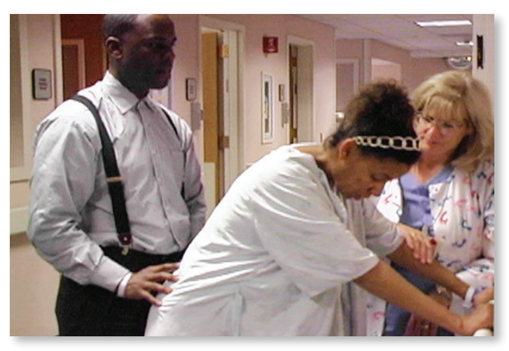
Forward-leaning positions can help your baby rotate to an optimal position for birth.