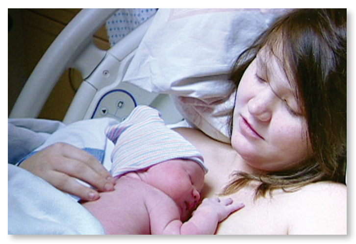
Following the Six Lamaze Healthy Birth Practices can help you have the safe and healthy birth you want—naturally.

he six care practices described in this booklet are supported by extensive scientific research, yet surprisingly, only 2 percent of women actually experience all of these practices in U.S. hospitals. Carefully choosing a care provider, taking a childbirth class, and writing a birth plan will increase your chances of experiencing them in your labor.