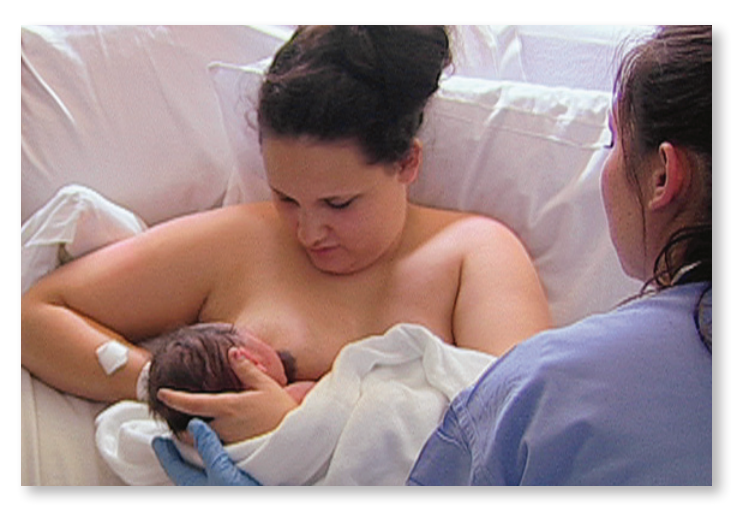
Holding your baby skin to skin naturally supports breastfeeding.