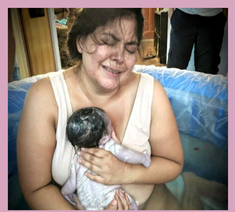
The above photo is a women that has just given birth vaginally after 2 cesareans.

Vaginal birth after cesarean is when a woman gives birth vaginally after having a previous cesarean. This can refer to a vaginal birth after one, two or three cesareans.