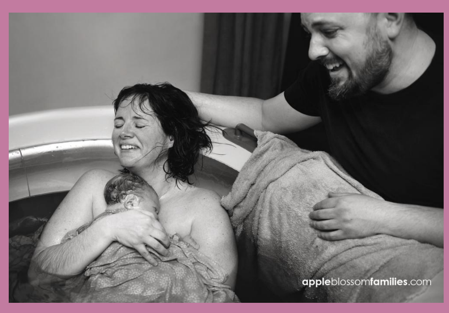
A woman gives birth vaginally after 1 cesarean.